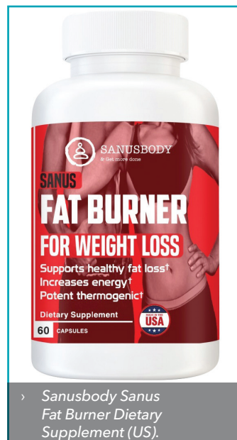
➤ Sanusbody Sanus Fat Burner Dietary Supplement (US).

Sugar reduction is another trend consumers are supporting. The water activity requirement for shelf life stability makes this especially difficult. Simply put, sugars add solids that lower water activity. Gum acacia (E 414), can help formulators add solids